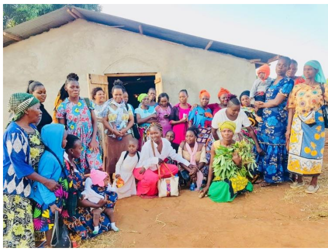
Sisters Conference at Kiruku